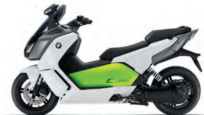
N5C Paintwork in Light White/Electric Green/Seat in Black