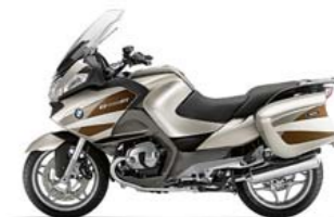
Light Magnesium Metallic/ Magnesium Beige Metallic