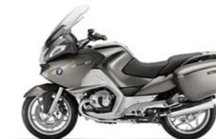
Fluid Grey metallic

Dimensions refer to unladen motorcycles as per DIN standard definition. (1) As defined in EU directive 93/93/EEC, filled with all operating fluids, fuelled to at least 90% of usable tank capacity. (2) Unladen weight without operating fluids.