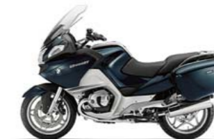
Midnight Blue metallic