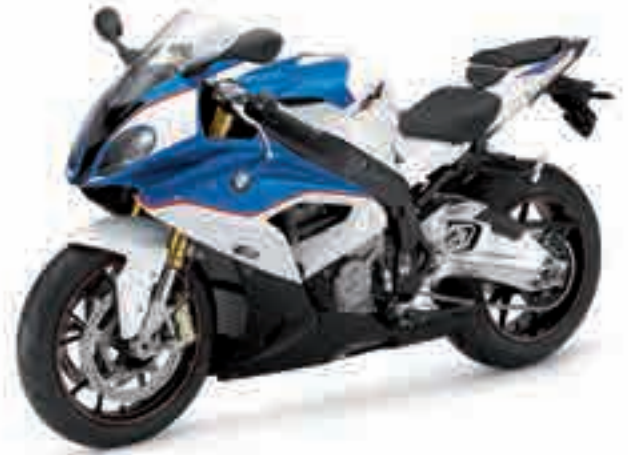
ND7 Paintwork in Motorsport colours: Light White/Lupin Blue Metallic/Racing Red/ Seat in Black/Silver-anodized swinging arm*