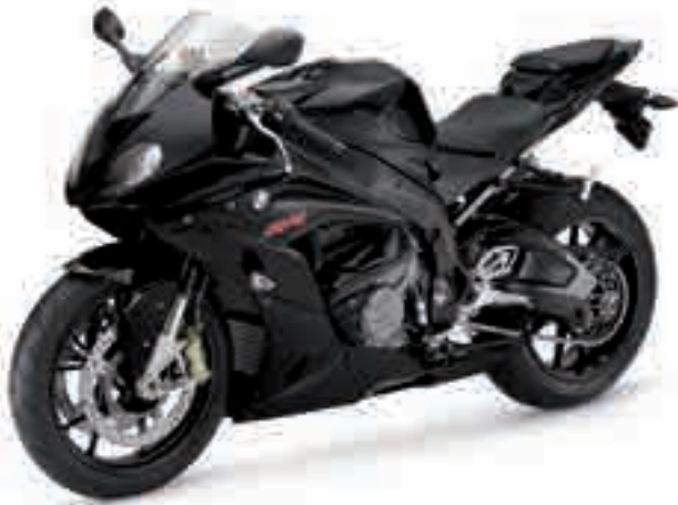
ND2 Paintwork in Black Storm Metallic/Seat in Black/Swinging arm in Black