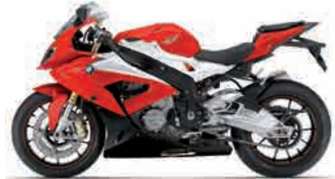
ND6 Paintwork in Racing Red/Light White/Seat in Black/Silver-anodized swinging arm*